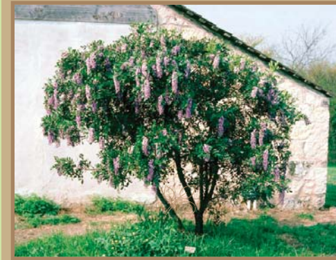
Texas Mountain Laurel