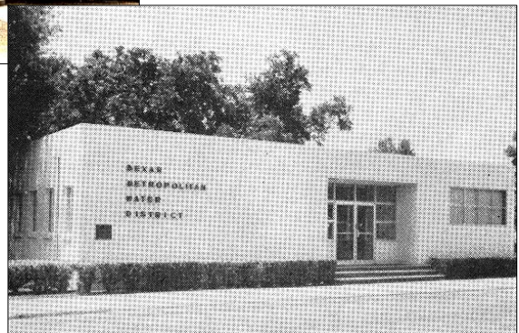
District Service Center circa:1958